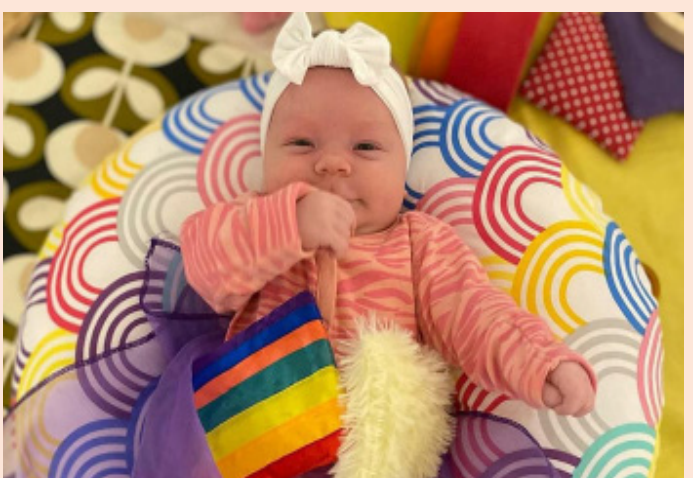
Baby & Parent: 11 and 25 July Little Penlee Explorers: 19 July and 9 August Family Activities: Every Saturday Afternoon